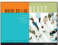
Where Do I Go Next?